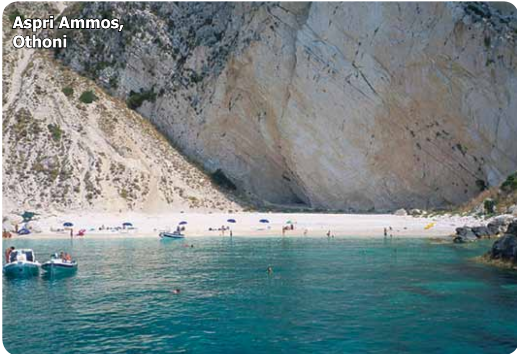
Aspri Ammos, Othoni