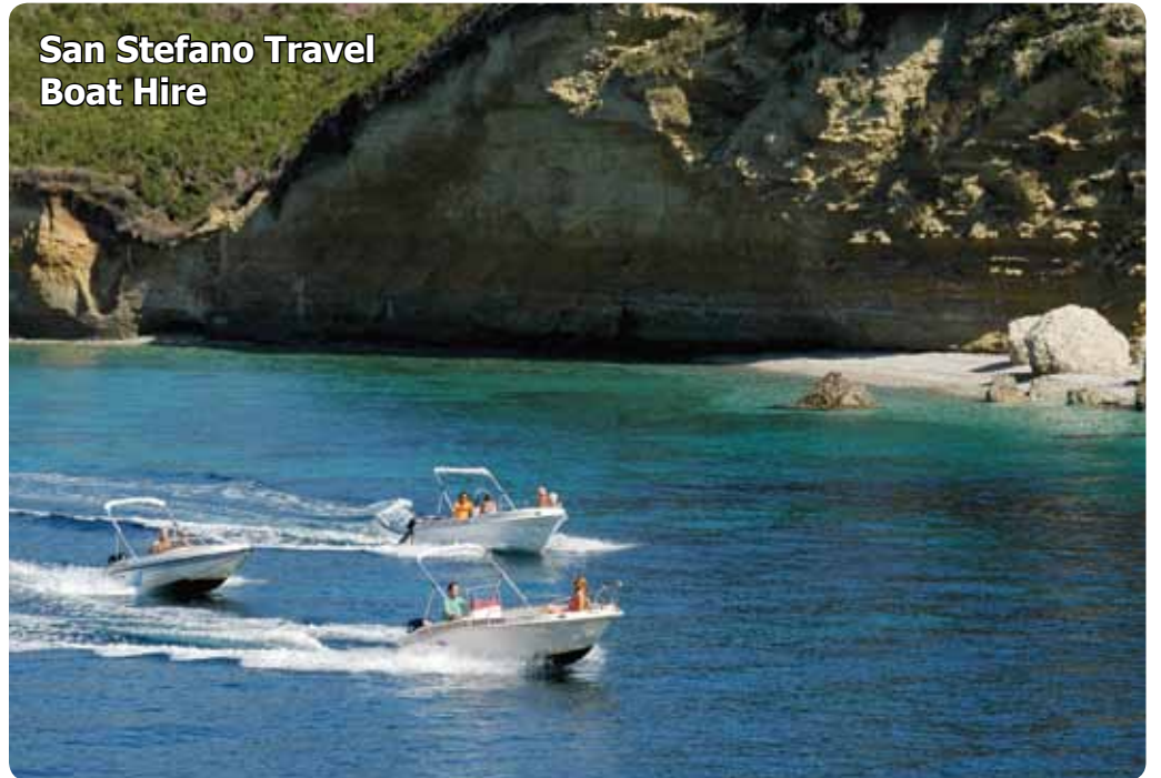
San Stefano Travel Boat Hire