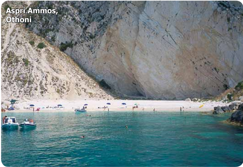
Aspri Ammos, Othoni